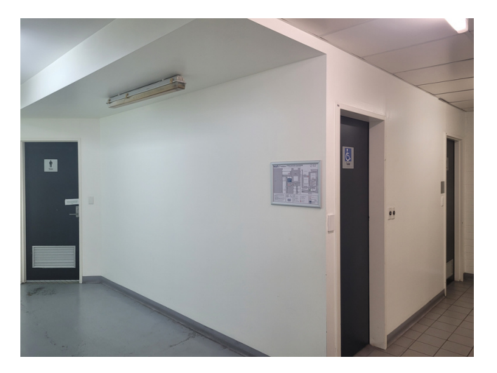
Image description: Local public toilets. White hallway with three navy blue doors.