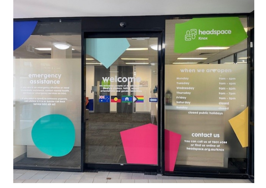
Image description: View of the entrance of the building. Access to the foot path is flat to the left of the photo. The ground is tiled before changing to carpet when you enter the building. The reception desk is immediately in front of the entrance.

The street facing door of the building which directly faces Capital City Boulevard is not accessible for entry unless it has been open by staff. Please use the foyer entry above.