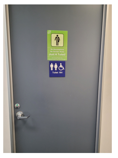
Image description: A grey door with a sign next to it that reads, "No Assumptions. No Gender Roles. Just a Toilet!" and "Toilet RH". There is carpet at the entrance of the door.

One toilet is located at the back of the building past Reception. It is a gender neutral, disabled toilet. The doorway of the toilet is 89cm wide and the sink is 77cm off the ground. There is hand railing in here too. We have access to the local public toilets in our back hallway. There are male, female and disability/gender inclusive toilets available.