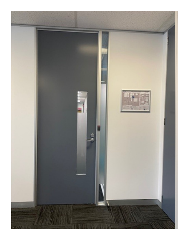
Image description: The locked grey door leading to the hallway to access consulting rooms. Grey Door with posters. Sign reads "No Access, Authorised Personal Only"

Consulting rooms are located behind a locked door beside Reception accessed by a wide hallway. Each room is slightly different in colours and furnishings. All rooms have a couch, lounge chair, a desk and office chair. Rooms have a small window in the door and have no other window. They all have artificial, florescent lighting.