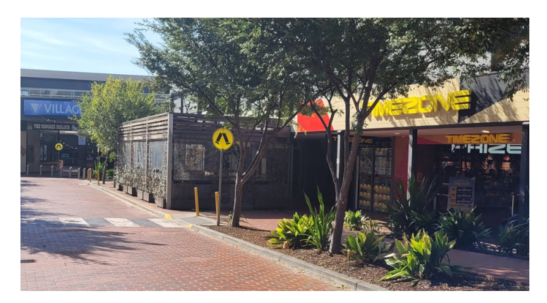
Image description: View of walk through of Ozone, past Timezone to get to Capital City Boulevard.

Image description: View of Ozone restaurants.