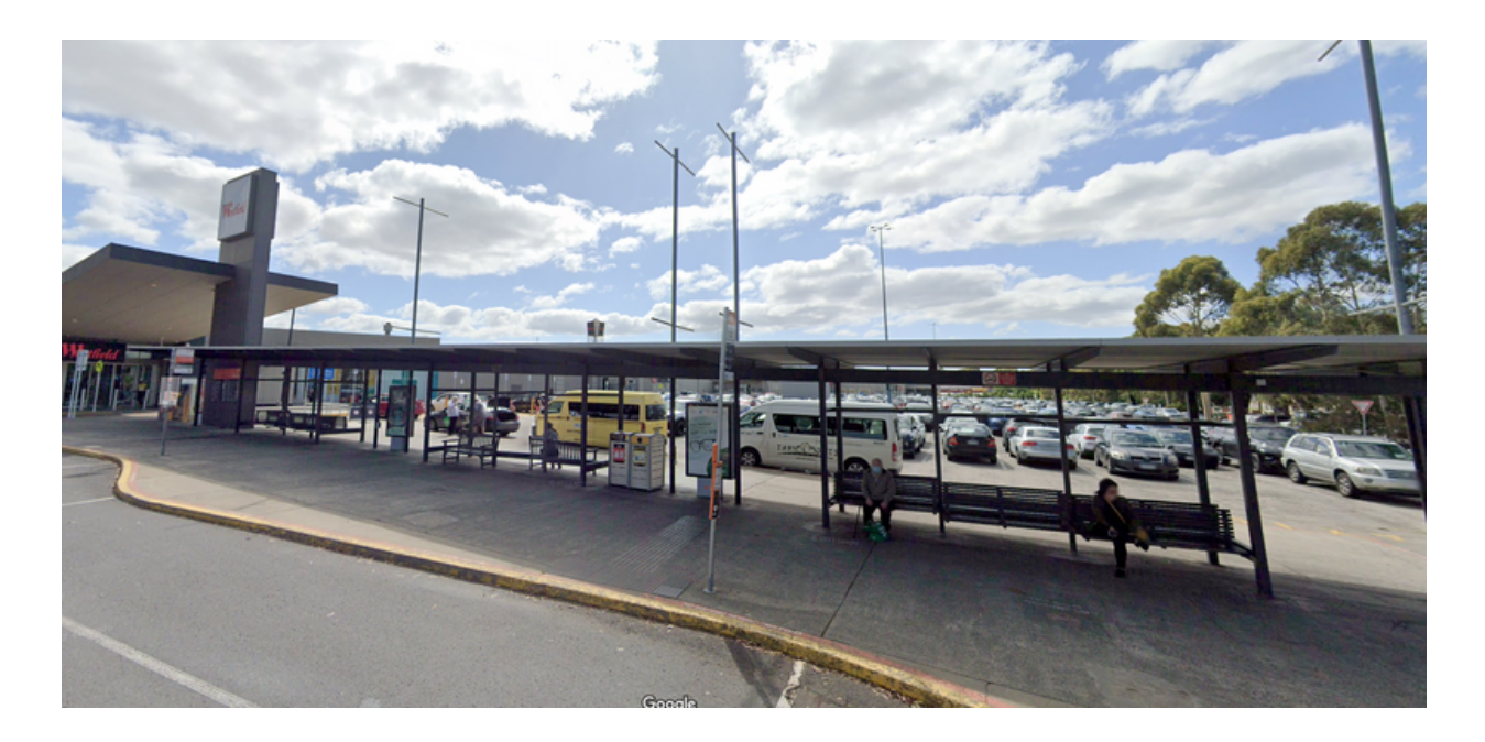
Image description: View bus interchange located at southern side of Westfield Knox.

The bus interchange is located outside the main level two entrance at the southern side of Westfield Knox centre. To get to headspace Knox from here you can walk through the centre towards Knox Ozone. We are located outside Knox Ozone on Capital City Boulevard.