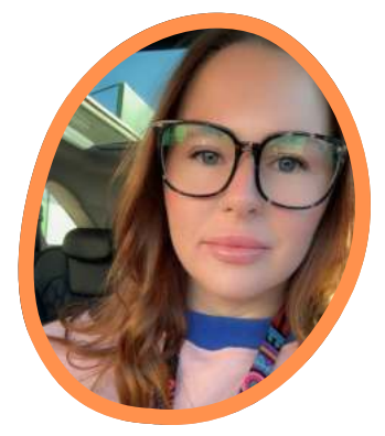
Jasmine client services