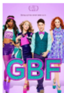
(Gay Best Friend)

A celebration for youth—but don't forget to bring your family and friends even the non LGBTQI ones.