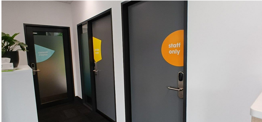
Right Image: The door with the blue sign leads to the hallway, and it leads you to the counselling rooms or bathroom.