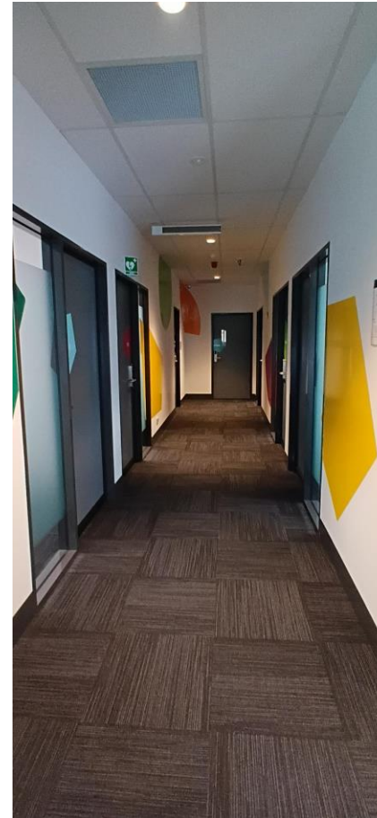
middle Image: The hallway that leads to different rooms