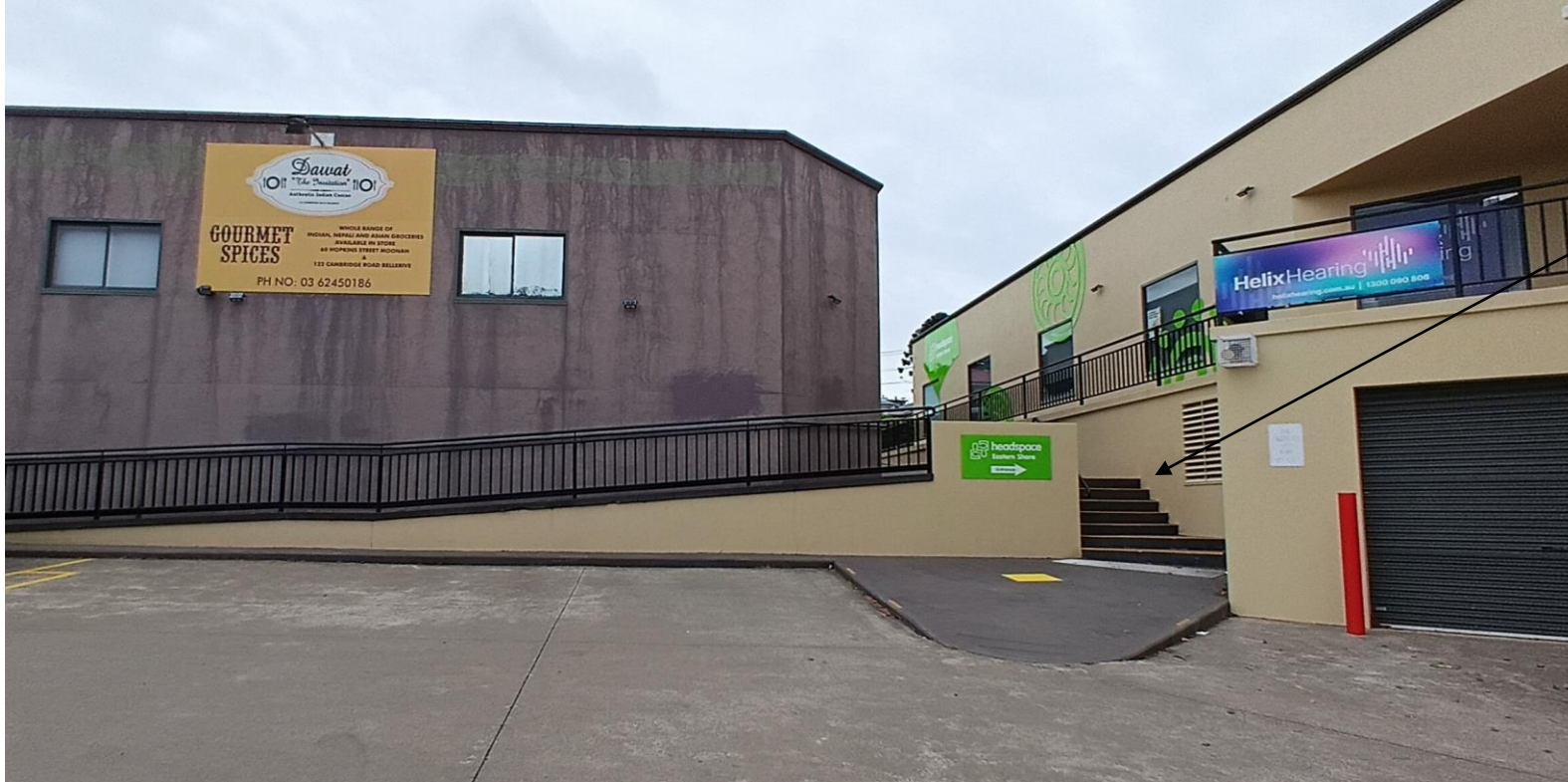
Left Image: Side view of the building we are located in. There is a staircase with seven (7) steps, and on the left of the sign, there is a ramp.

There are seven stairs to climb to Cambridge Road.