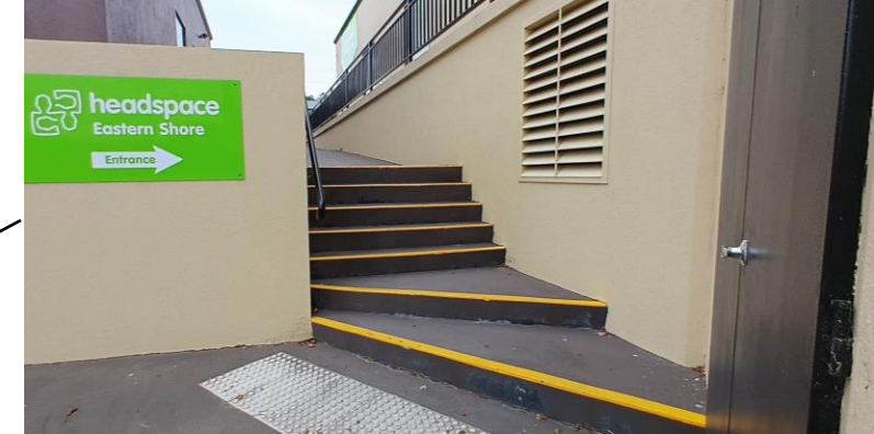
Right Image: The staircase that will take you to the only entrance to the centre on 120 Cambridge Road.