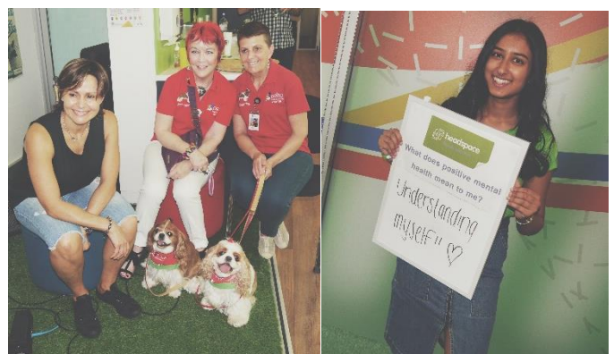
Participants at our Youth Open Day