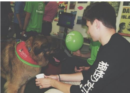
More photos from our Open Day. Participants enjoying the Delta Therapy dogs!