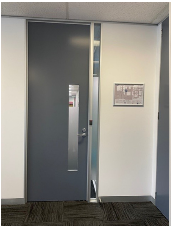
Image description: The locked grey door leading to the hallway to access consulting rooms. Grey Door with posters. Sign reads "No Access, Authorised Personal Only"

Consulting rooms are located behind a locked door beside Reception accessed by a wide hallway. Each room is slightly different in colours and furnishings. All rooms have a couch, lounge chair, a desk and office chair. Rooms have a small window in the door and have no other window. They all have artificial, florescent lighting.