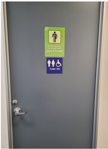
Image description: A grey door with a sign next to it that reads, "No Assumptions. No Gender Roles. Just a Toilet!" and "Toilet RH". There is carpet at the entrance of the door.

One toilet is located at the back of the building past Reception. It is a gender neutral, disabled toilet. The doorway of the toilet is 89cm wide and the sink is 77cm off the ground. There is hand railing in here too. We have access to the local public toilets in our back hallway. There are male, female and disability/gender inclusive toilets available.