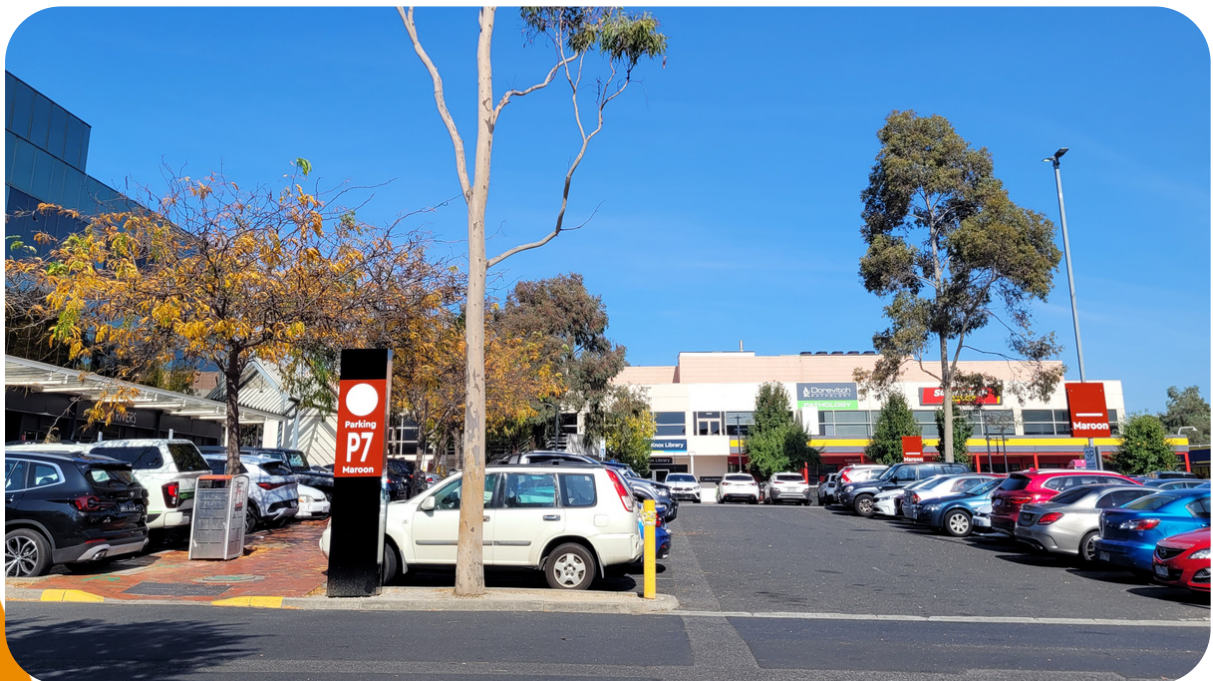
Image description: View of car parking located directly opposite Knox Ozone (P7 Maroon Parking). There is multiple cars, small trees, a rubbish bin and the car park is on a small decline.

The entrance to headspace Knox is approximately 20-100 Meters from the car park. There is more parking around Westfield Knox with multiple level parking available a short walk from the headspace Knox Centre.