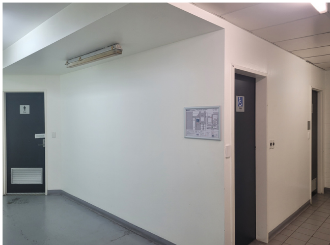
Image description: Local public toilets. White hallway with three navy blue doors.