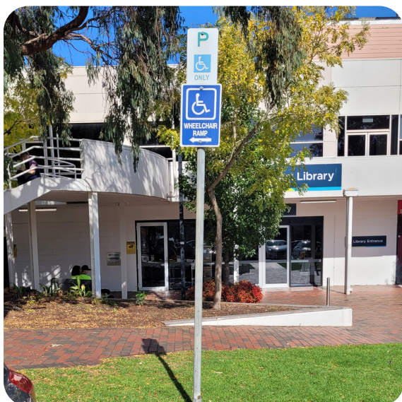
Image description: Disabled parking spot/signage located at the front of Knox Library short distance from headspace Knox. Wheelchair ramp to access site located across from car park.