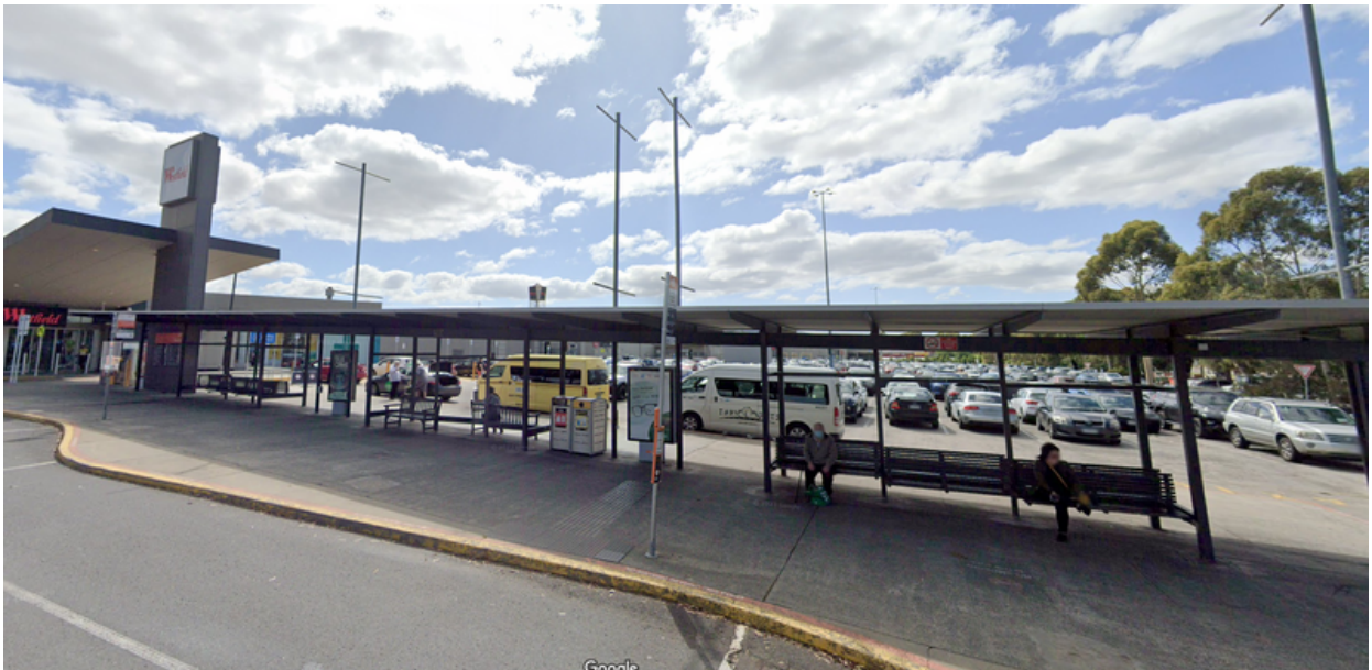
Image description: View bus interchange located at southern side of Westfield Knox.

The bus interchange is located outside the main level two entrance at the southern side of Westfield Knox centre. To get to headspace Knox from here you can walk through the centre towards Knox Ozone. We are located outside Knox Ozone on Capital City Boulevard.