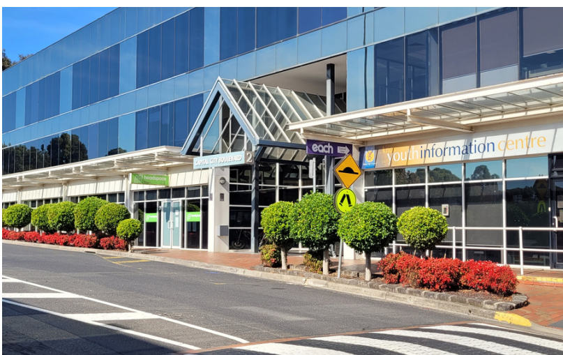
Image description: View of the entrance of the building from before crossing at the pedestrian crossing at Capital City Boulevard.

From the bus interchange it is approximately 600 meters to headspace Knox. You will need to walk through the centre and Knox Ozone, past the Village Cineas and Timezone and cross at the Pedestrian crossing at Capital City Boulevard. The intersections are often busy with buses, cars and foot traffic.