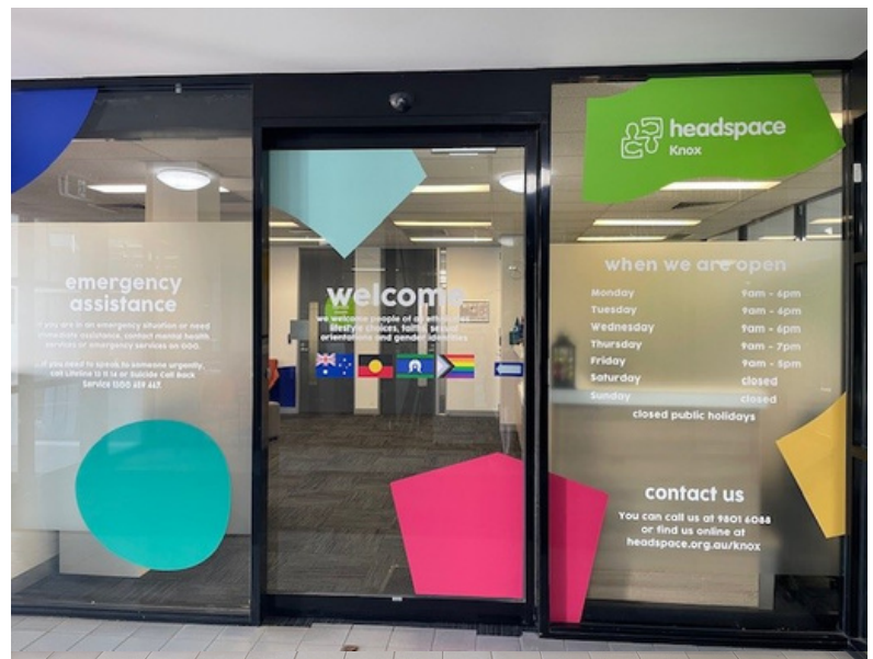
Image description: View of the entrance of the building. Access to the foot path is flat to the left of the photo. The ground is tiled before changing to carpet when you enter the building. The reception desk is immediately in front of the entrance.

The street facing door of the building which directly faces Capital City Boulevard is not accessible for entry unless it has been open by staff. Please use the foyer entry above.