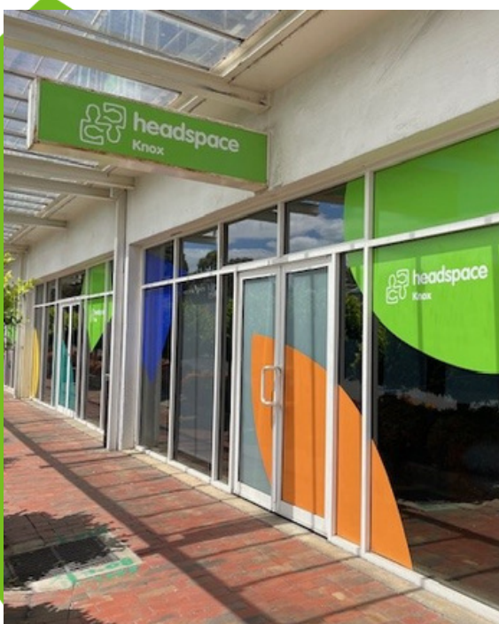
Image description: View of the street facing door. The green headspace logo can be seen over a glass door. This entryway is generally locked and cannot be opened from the outside.

The street facing door of the building which directly faces Capital City Boulevard is not accessible for entry unless it has been open by staff. Please use the foyer entry above.