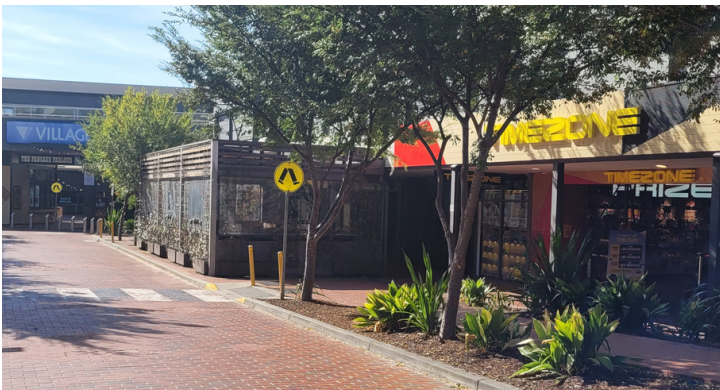
Image description: View of walk through of Ozone, past Timezone to get to Capital City Boulevard.

From the bus interchange it is approximately 600 meters to headspace Knox. You will need to walk through the centre and Knox Ozone, past the Village Cineas and Timezone and cross at the Pedestrian crossing at Capital City Boulevard. The intersections are often busy with buses, cars and foot traffic.